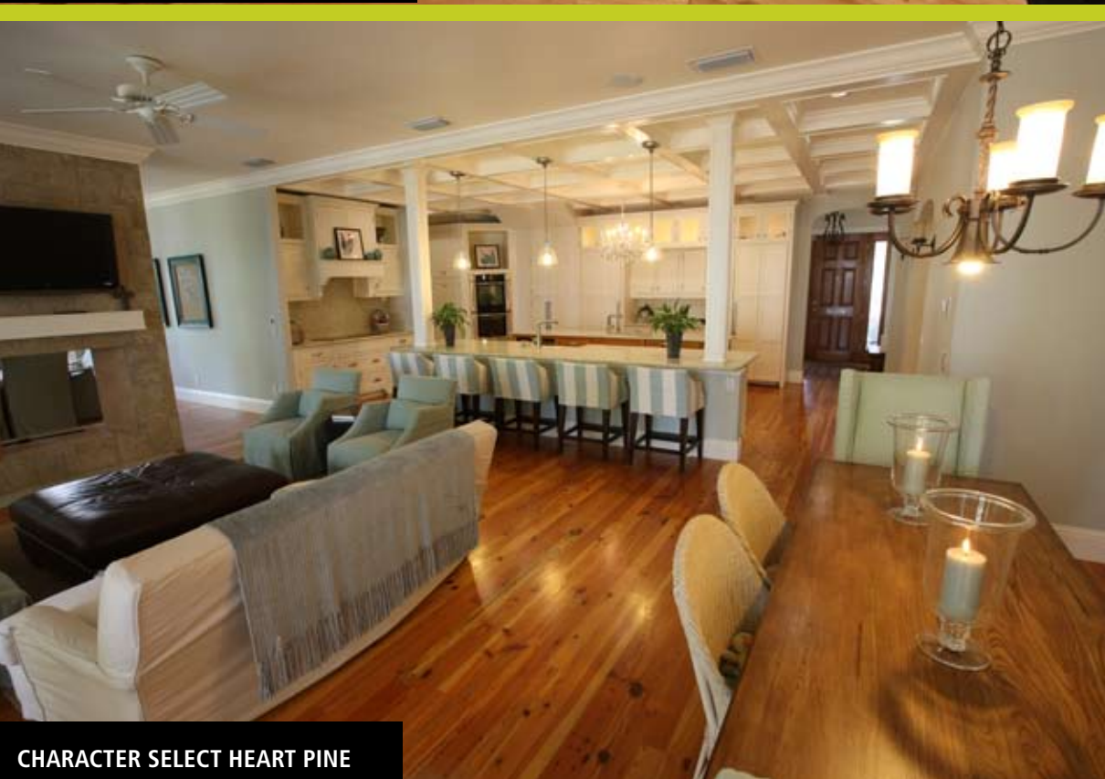
CHARACTER SELECT HEART PINE