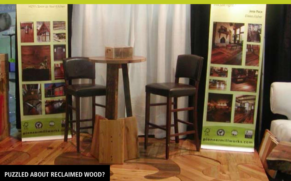
PUZZLED ABOUT RECLAIMED WOOD?