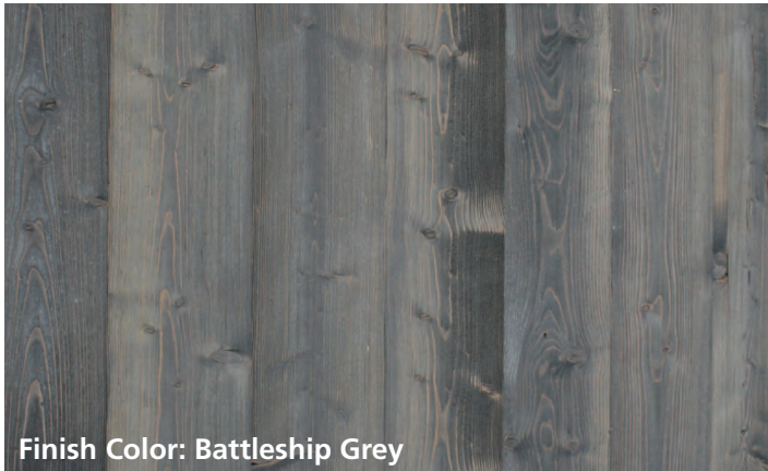
Finish Color: Battleship Grey