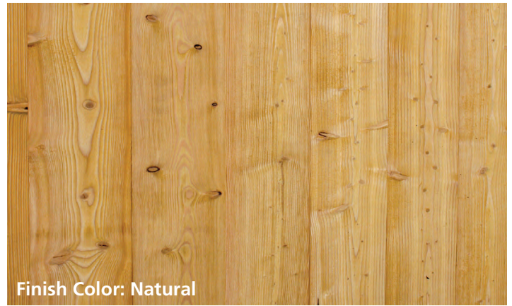
Finish Color: Natural