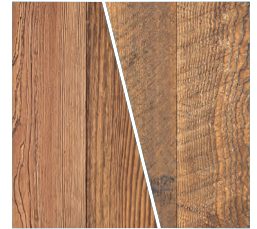
Light Brown— Wire Brushed\Circle Sawn