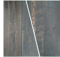
Battleship Grey Wire Brushed\Circle Sawn