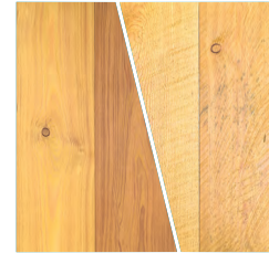
Natural— Wire Brushed\Circle Sawn

Recommend 7–12% additional material for on-site grading, trimming and installation factors.