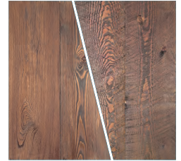
Mahogany Wire Brushed\Circle Sawn