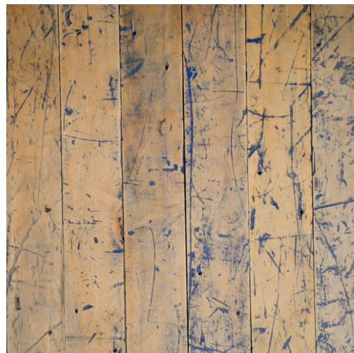
Shown in Gentleman's Grey— many color options available.

Recommend 7–12% additional material for on-site grading, trimming and installation factors.