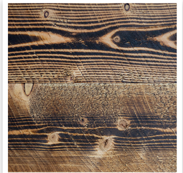
Shou Sugi Ban—Shallow Char Circle Sawn

Our Larch Exterior and Larch Shou Sugi Ban products all come standard with two coats of sealer applied to the face and one to the back in house. Touch-up kits are available upon request to treat cut ends/splices. These pre-finished products do require regular maintenance in the form of a refresh coat every 2-3 years to prevent wood degradation. All sealer products used are available for purchase direct from the manufacturer.