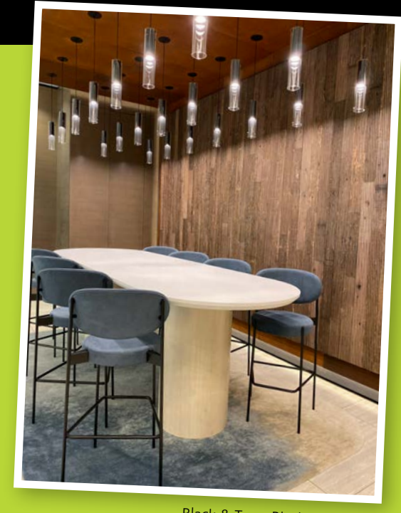
Black & Tan—Black Raked Oak