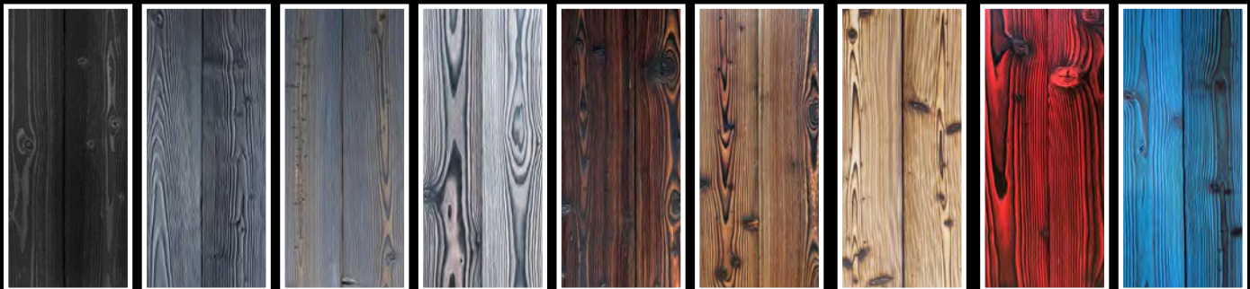
Carbon | 2

Larch is a durable wood exterior option with attractive tones, interesting grain patterns, rot, insect and fire-resistant. Our Shou Sugi Ban Larch Twice-Brushed can just as comfortably clad an interior wall providing a bold statement to any indoor design.