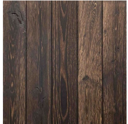
Shown in Undressed

Recommend 10-15% additional material for on-site grading, trimming and installation factors.