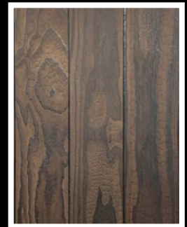
Undressed | 1