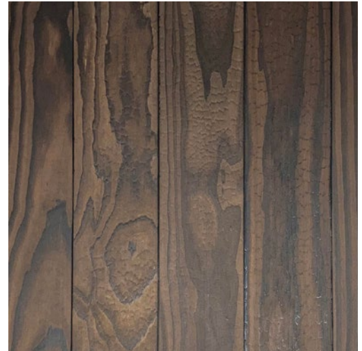
Shown in Undressed | 1

Recommend 10-15% additional material for on-site grading, trimming and installation factors.