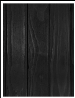
Carbon | 1

ACCOYA is a premium rot and insect resistant material, well known for its durability and ability to withstand the tests of any climate. Applying the Shou Sugi Ban preservation method increases the overall look and life of the wood, while providing a sustainably sourced, naturally beautiful material that takes well to stains and coating.