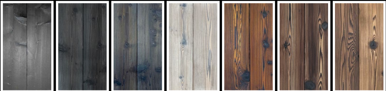
Carbon | 2

Cedar is a naturally insect-repellent domestic species especially well-suited for exterior applications. Boards include sound tight knots which allow us to minimize waste and celebrate the true to the nature of the tree. Designed to be a hardy siding option that can withstand the most unforgiving weather, our Shou Sugi Ban Cedar Twice-Brushed can just as comfortably clad an interior wall that's in need of some additional flair.