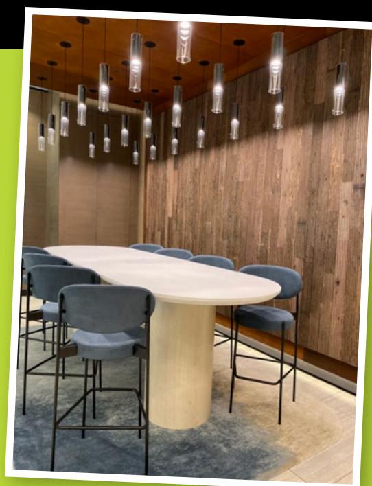
Black & Tan—Black Raked Oak