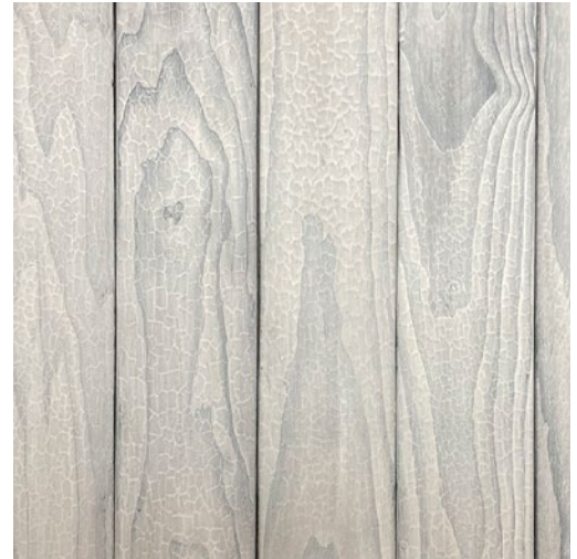
Shown in White

Recommend 10-15% additional material for on-site grading, trimming and installation factors.