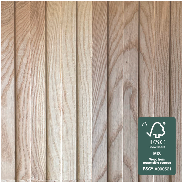
Raked™ Wide Ash