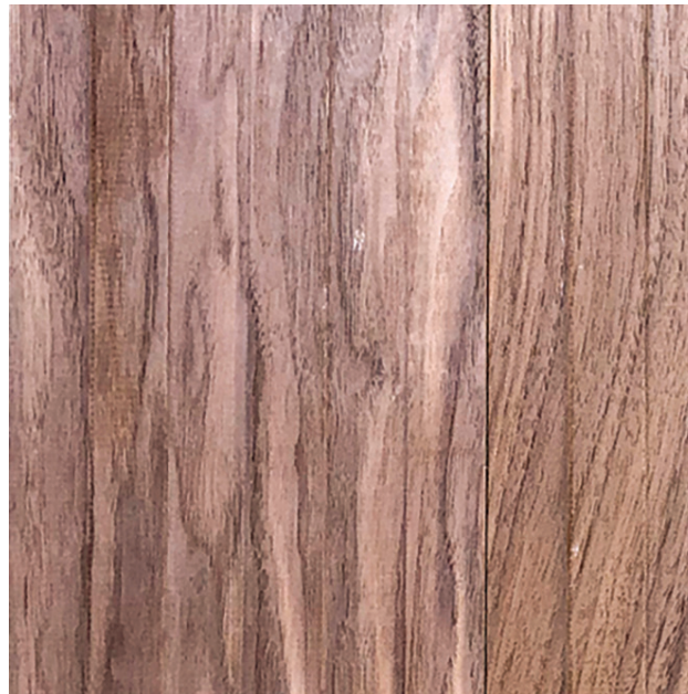
Raked™ Wide Walnut