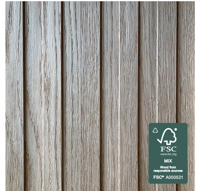
Raked™ Wide White Oak