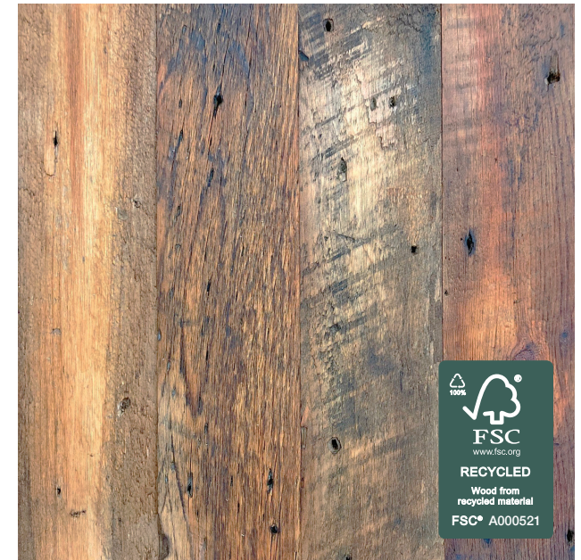
Clear Sealer + FRT