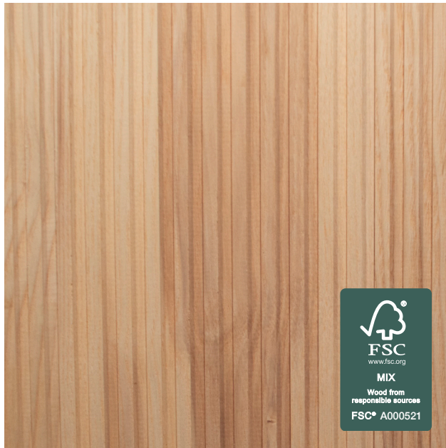
Raked™ Standard Ash