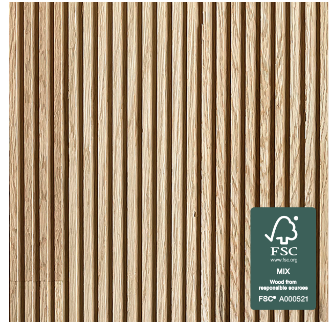
Raked™ Standard White Oak