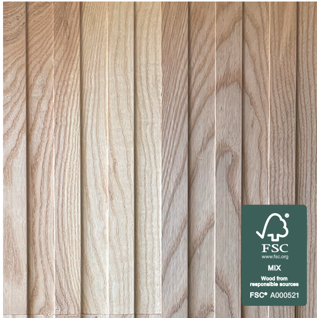
Raked™ Wide Ash