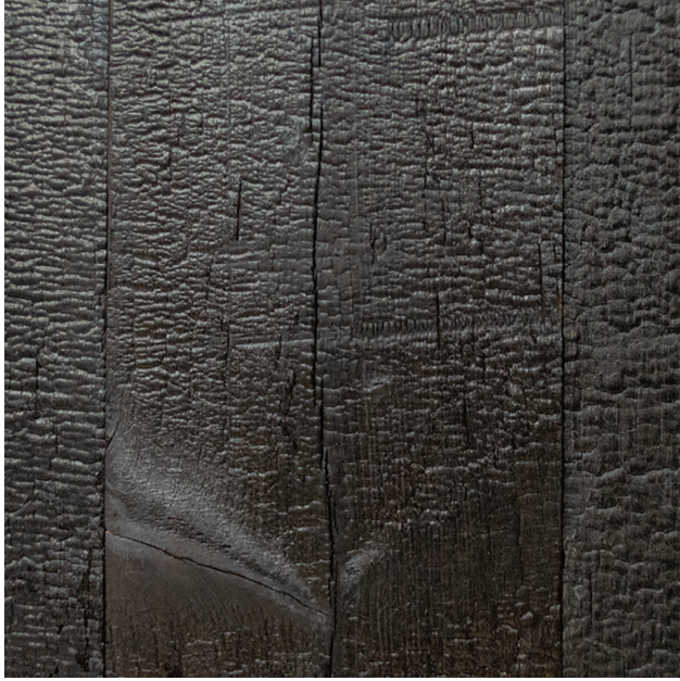
Larch Deep Char