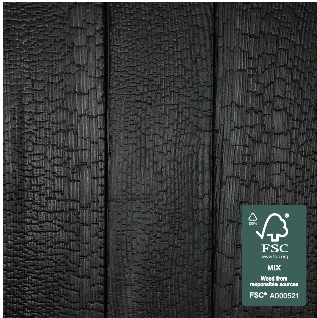
Fir Deep Char