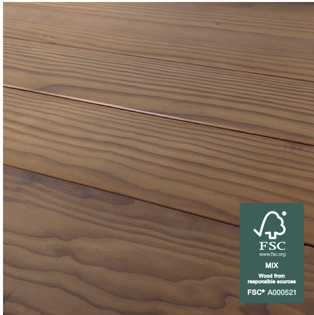
Abodo® Vulcan Decking