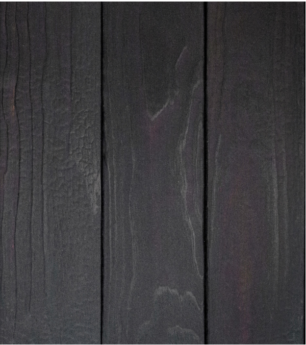
Toasted ( Interior Use Only )