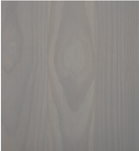
Pearl SKU# 15181118712