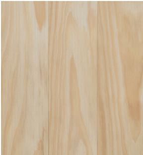
Unfinished SKU# 15381110012