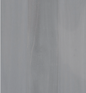
Pebble SKU# 15381112912