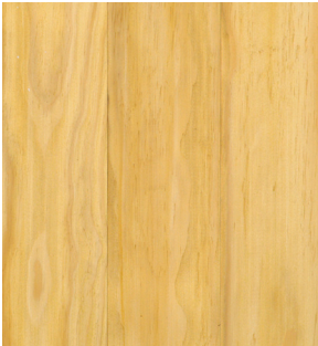
Sand SKU# 15381113012