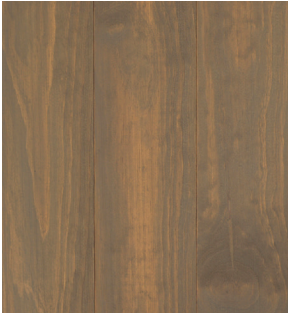
Fossil SKU# 15381113412