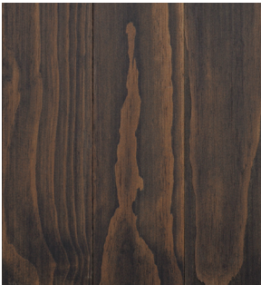
Cocoa SKU# 15381113212