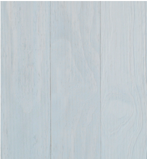
Nickel SKU# 15381112612