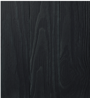
Black SKU# 15381112712