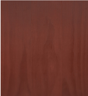
Poppy SKU# 15181119012