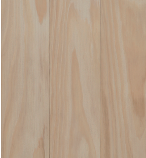
Clear SKU# 15381111412