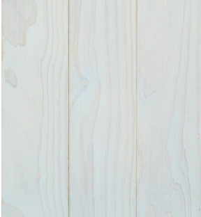
Scandi SKU# 15381112512