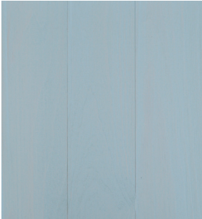
Primed SKU# 15381113712