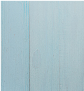
Lowcountry Blue SKU# 15181118812