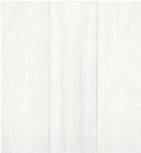
Cloud SKU# 15381112412