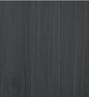
Storm SKU# 15381112812