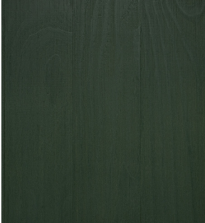
Mountain Laurel SKU# 15181118912