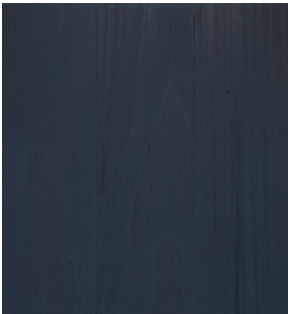
Twilight Blue SKU# 15181119112