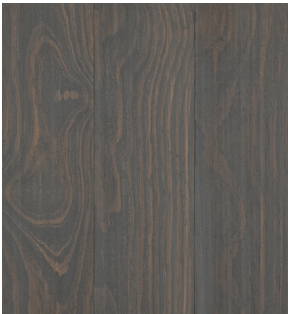
Hazy SKU# 15381113312