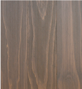
Grove SKU# 15381116112