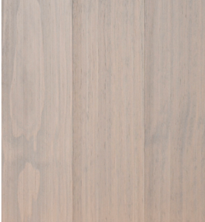
Fawn SKU# 15381116212