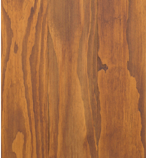
Tawny SKU# 15381113112