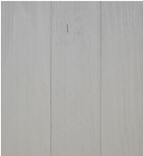
Clay SKU# 15381116312