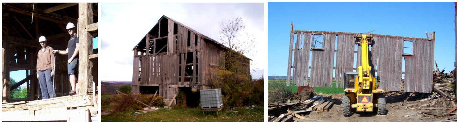
(Our acquisition crew carefully dismantles agricultural buildings that have outlived their use.)

Pioneer Millworks carefully re-cuts and re-mills the old wood, maintaining the original saw marks, knots, wear marks, nail holes, scuffs, and naturally occurring vagaries. This more relaxed and rugged grade is available in Oak, Chestnut, and Mixed Hardwoods, offering a variety of color and grain patterns. Settlers' Plank Mixed Hardwoods includes a number of reclaimed species from Oak to Hickory, Ash, Maple, Beech, Elm, and Chestnut.